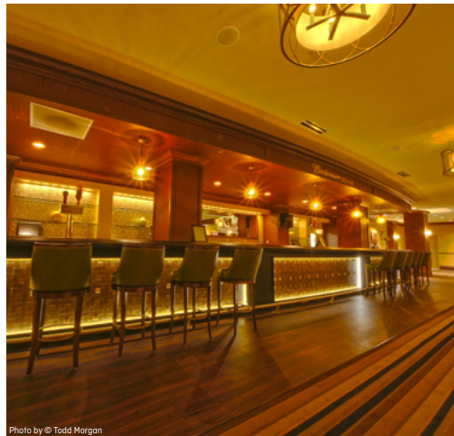
Budweiser Kiel Club Cocktail Reception