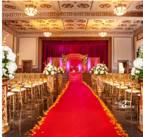
Ballroom Ceremony: 225 Max Seated Capacity