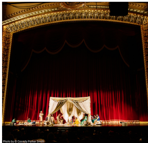
Main Theatre Ceremony: 300 Max Seated Capacity