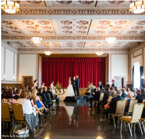
Ballroom Ceremony: 225 Max Seated Capacity