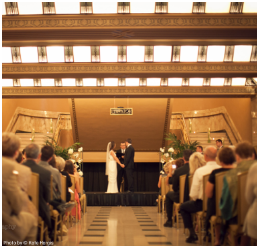
Ticket Lobby Ceremony: 300 Max Seated Capacity