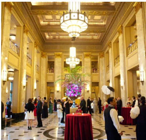
Grand Lobby Cocktail Reception