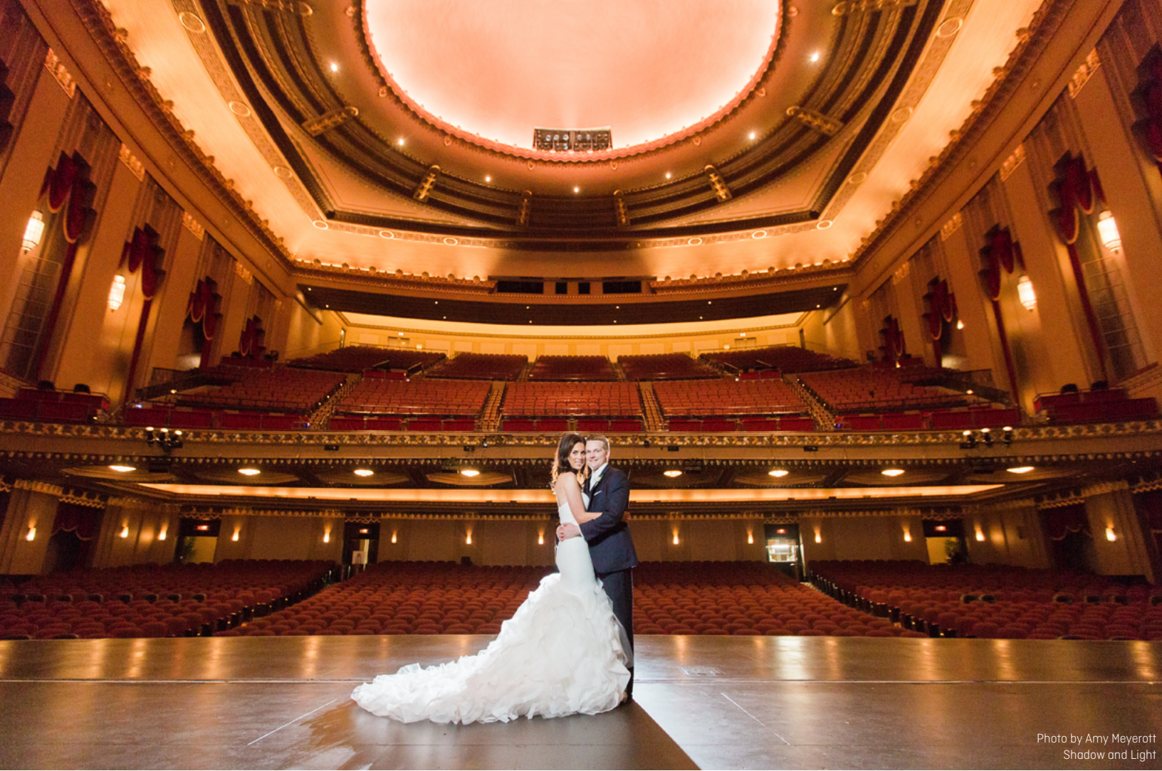
Shadow and Light