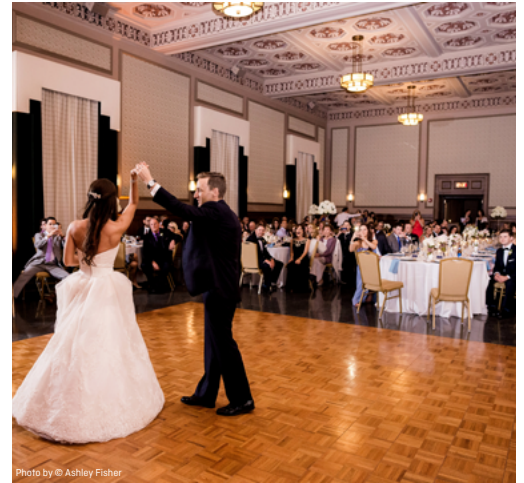
Ballroom Reception: 225 Max Seated Capacity