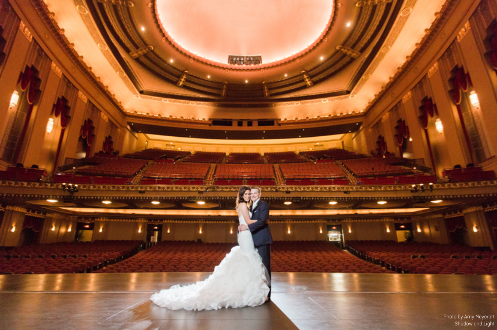
Shadow and Light