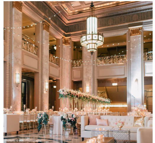
Grand Lobby Reception: 350 Max Seated Capacity